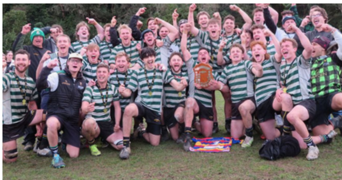
OBU Scallywags with the U85kg Division 1 Paul Potiki Shield.

Find out more about how rugby and study is a winning combination for OBU.