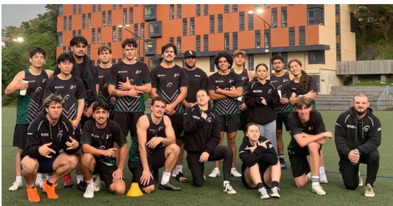
OBU Academy cohort of 2023, training at the Boyd-Wilson turf