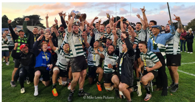
OBU Premiers celebrating winning the 2024 Jubilee Cup Final

Find out more about how rugby and study is a winning combination for OBU.