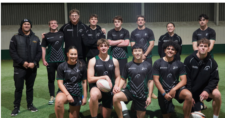
OBU Academy cohort of 2024, training at the Boyd-Wilson Arena