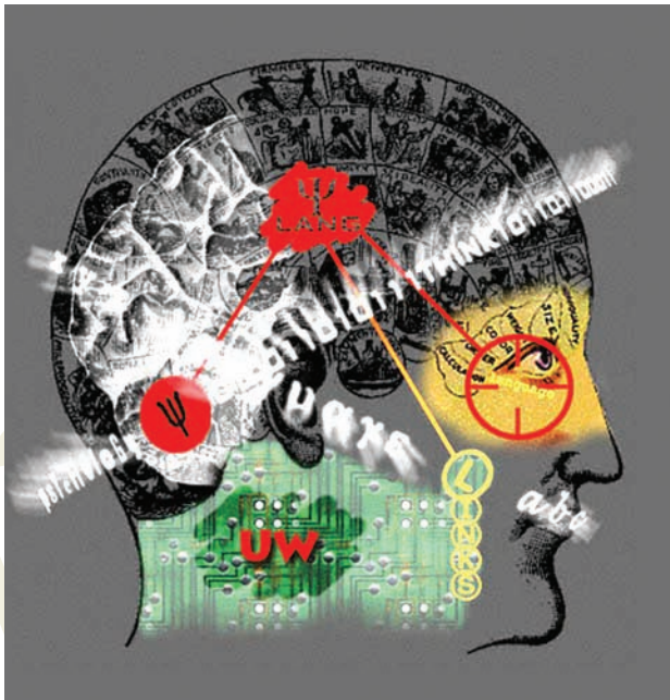
Department of Psychology, University of Wisconsin-Madison

Advertising consultant • Arts administrator • Assistant policy analyst • Broadcaster • Communications officer • Customs adviser • Editor • Education researcher • EEO adviser • ESOL teacher • Forensic linguist • Information officer • Interpreter • Language teacher • Language therapist • Lecturer • Legal drafter • Lexicographer • Linguist • Literacy adviser • Market analyst • Market researcher • Patent examiner • Policy adviser • Publisher • Teacher • Technical writer • Translator • Tutor • Voice coach